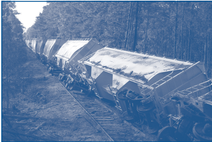
A nearby train is derailed after over 124,000 pounds of smokeless powder explodes in Minden, Louisiana.

Recently, ICE has been examining the safety management of explosives manufacturing facilities involved in decontamination, demilitarization or demolition of explosive materials. Such handling operations face significant risks as they frequently involve explosives, including fireworks, that may be of unknown origin and/or chemical compositions with unknown sensitivity or behavior. Damaged, altered or “dud” explosives and fireworks have an increased potential for inadvertent initiation and unknown sensitivity.